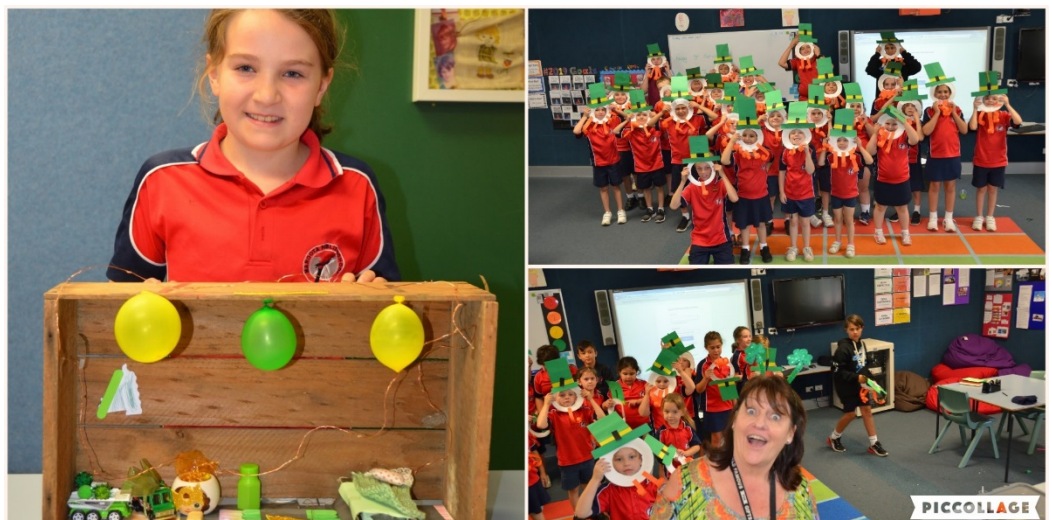
Celebrating St. Patrick's Day.

Attached to this newsletter is an offer to attend an A-League game between the Western Sydney Warriors and Sydney FC on Saturday 13 April 2019, 7:50pm at ANZ Stadium.