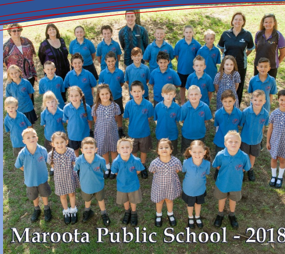
Maroota Public School - 2018

Tuesday, 2 nd April 2019 Volume 19, Issue 5